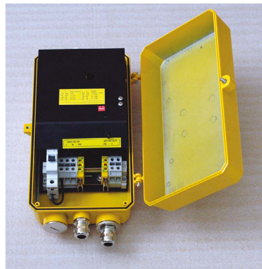
CEL-PS-115-48-05 Power Supply Unit